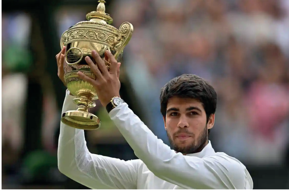
Second serving: Carlos Alcaraz has claimed his first Wimbledon title and second grand slam.

He had to fight back from what looked like a comfortable win for Djokovic in the first set. Alcaraz's nerves and the wind combined to give the veteran an easy time.