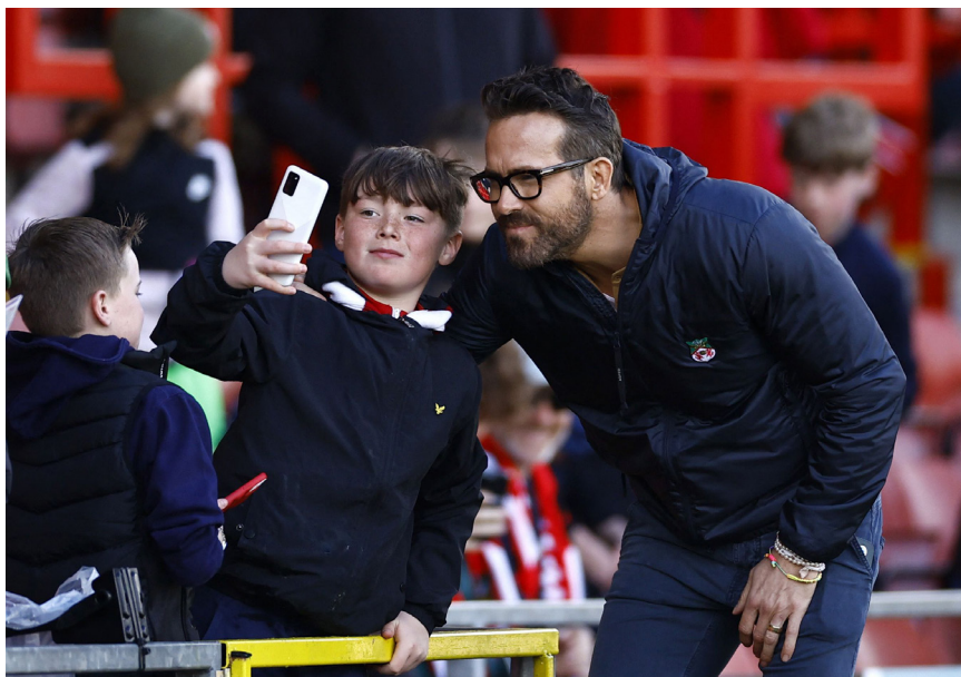
Fan Favourite: Wrexham's loyal supporters have welcomed the Hollywood stars.