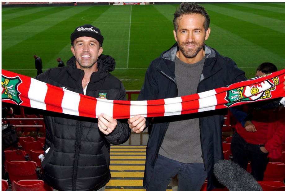
Red Dragons: Ryan Reynolds and Rob McElhenney own Wrexham AFC, the UK's fifth oldest club.